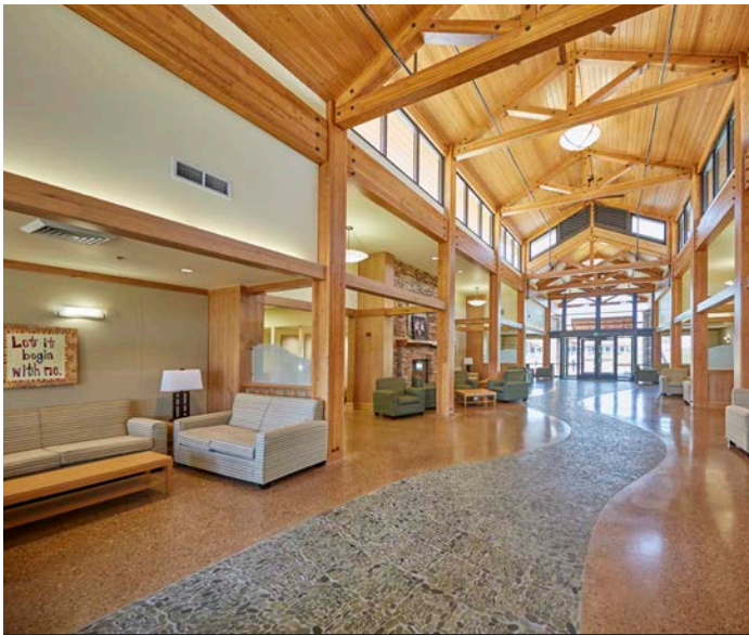
Gilbert Hall, Coburg Campus